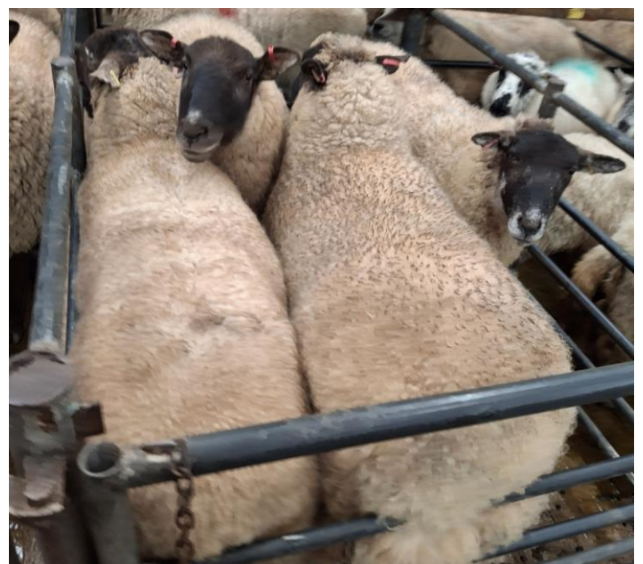
Ewes from BH Link sold for £216

Please market your sheep in a clean, dry condition and fully tagged. It now pays to feed your ewes, with customers looking for meat - leaner ewes are harder to sell